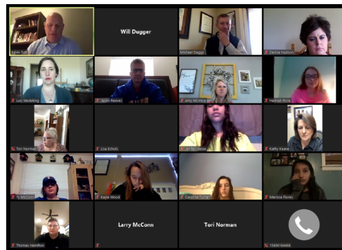
Session II Zoom Meeting

Project judging will be held on Wednesday, September 19th and will focus on five main criteria: Engagement ( who were your partners/volunteers ), Problem Solving ( how the project was affected by the pandemic ), Processes Used ( the strategy ), Results ( the effectiveness of