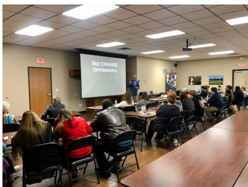
2020 Leadership TMCN Class

The Seminar will be held in the Large Conference Room of the WCTCOG beginning at 8:30 am and ending by 4:30 pm. The cost is $25 and includes refreshments and lunch. FMI Click Here or email us at tmcn@tmcn.org .