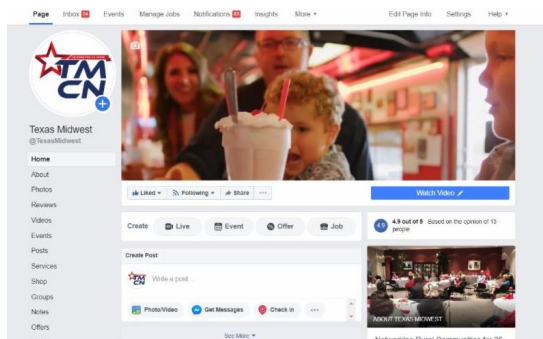
TexasMidwest Facebook Page

Traveling the region and left your printed 2020 Travel Guide? You can now have it in the palm of your hand. Access the Digital Guide here.