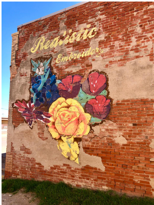
Merkel Business Mural

To learn more about the Leadership TMCN Program click here or give us a call at 325-795-8626.