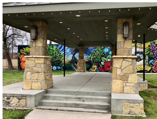
Clyde Pocket Park